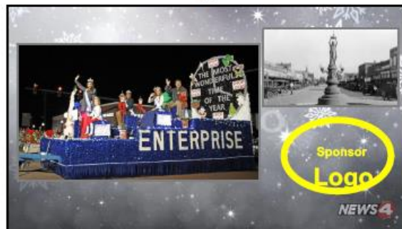
Split Screen Logo with motion background