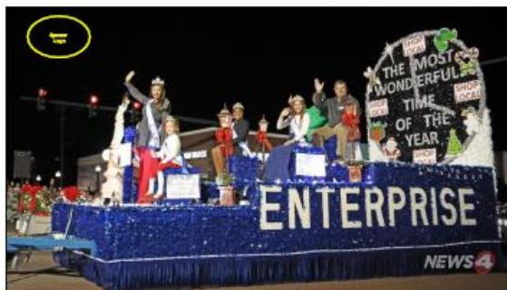
Overview shot sponsor