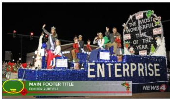
Lower 3 rd graphic